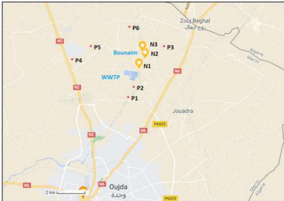
Figure 2. The localisation of the wastewater treatment plant (WWTP) and the sampling points (P1 to P6 for wells' water and N1 to N3 for the downstream water)